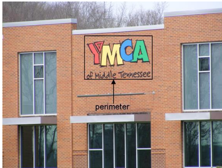
Example of copy without distinct background