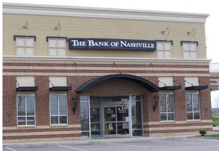
Example of copy and background as integrated unit